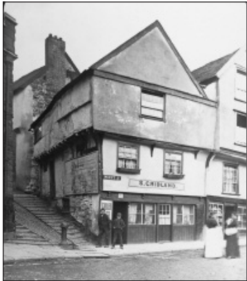
Houses in Stepcote Hill, West Street, before restoration in the 1930s.