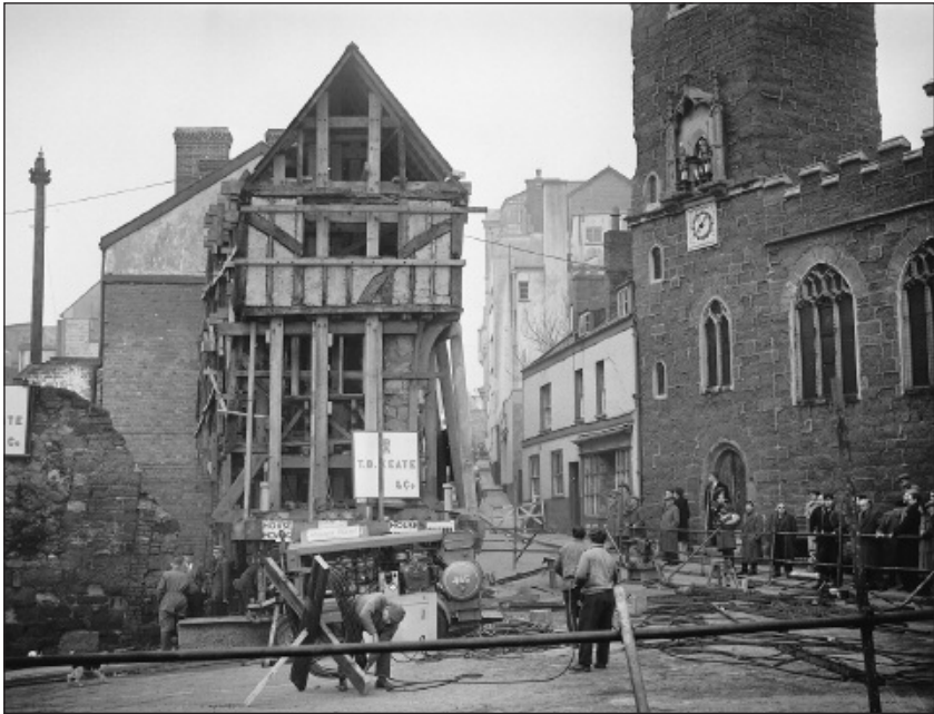
The installation of the house on the corner of West Street.