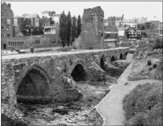
Exeter's thirteenth-century Exe Bridge.